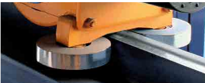
Guide rollers on the high level crane rail