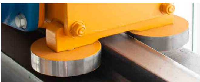
Guide rollers on the high level crane rail