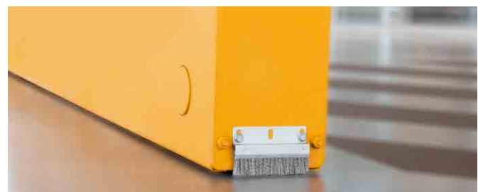
Floor rollers without guide rails